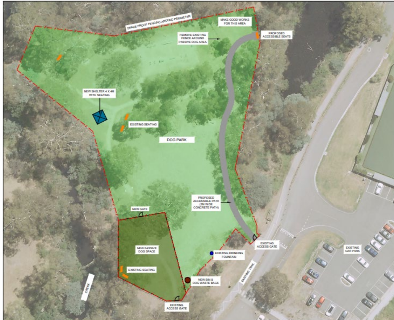
DOG PARK LANDSCAPING IMPROVEMENTS - CONCEPT PLAN